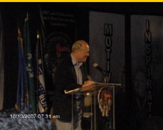
Keynote speaker Barry Switzer