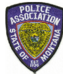
MPPA – Premier Sponsor of MT Torch Run