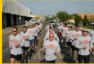
This photo won 3 rd place in OK