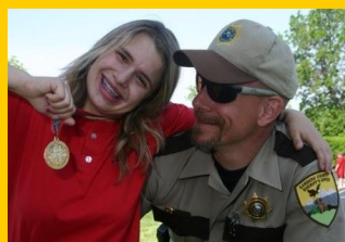
This photo won 1 st place in OK