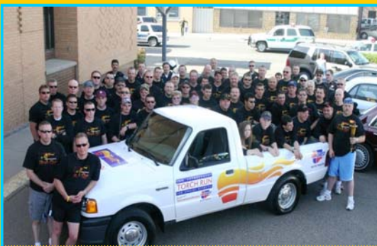
67 runners participated in the Final Leg this year