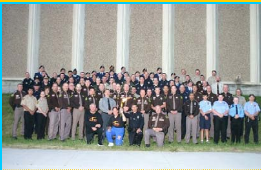
86 Circle of Honor participants attended this year