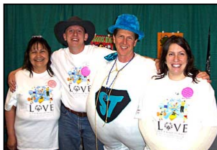
SuperTooth fights decay with a little help from friends. To learn more about Wellness Park and the Healthy Athletes initiative, visit www.somt.org.

Wellness Park to both the State Basketball Tournament and the State Winter Games, as well as to various area games.