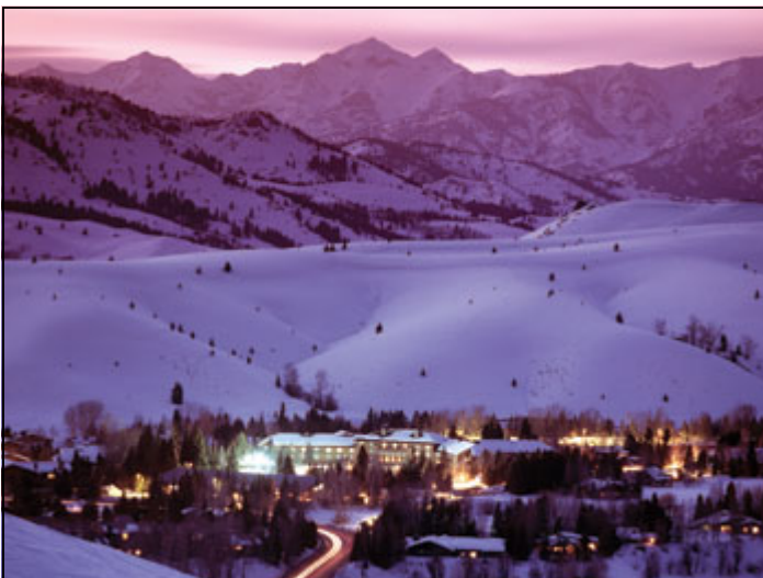
Sun Valley, Idaho, where Special Olympics athletes will compete in snowboarding and cross country skiing during the 2009 World Winter Games.